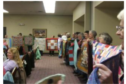
Quilts on Display...

Following the presentation in October, the Quilt Guild issued a challenge to sew 75 quilts for the NICU babies by February 2009.